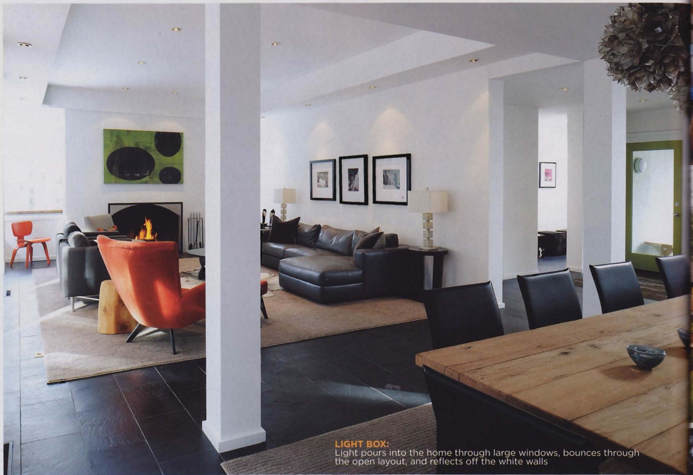
LIGHT BOX: Light pours into the home through large windows, bounces through the open layout, and reflects off the white walls