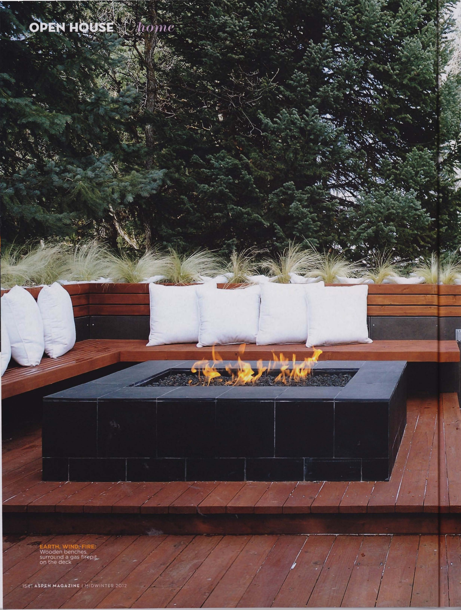
EARTH, WIND, FIRE: Wooden benches surround a gas firepit on the deck.