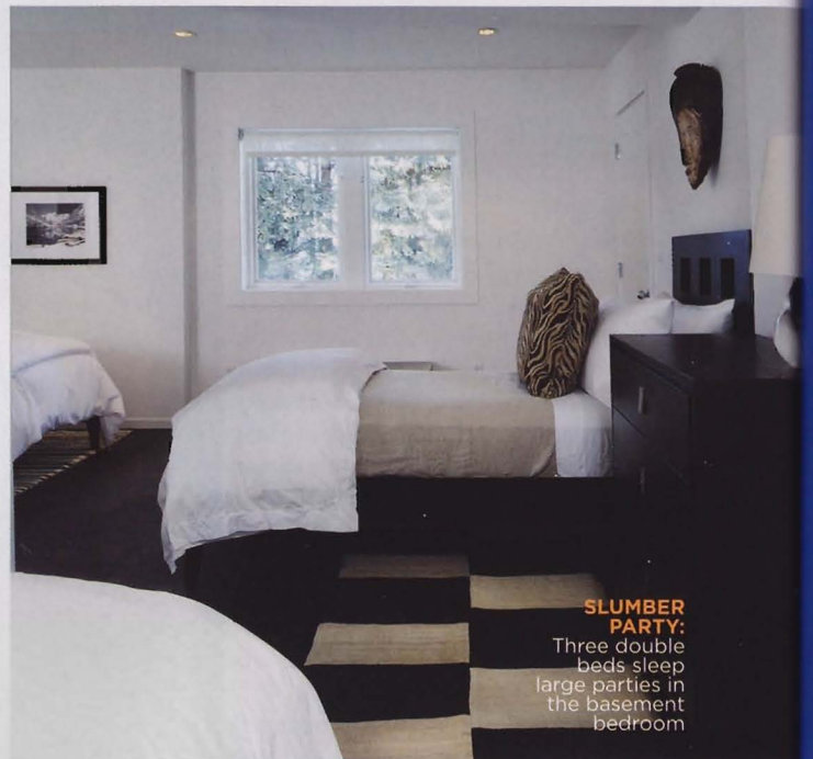
SLUMBER PARTY: Three double beds sleep large parties in the basement bedroom

AS PARAD This is a Flat's pr located all four s Parcel 8