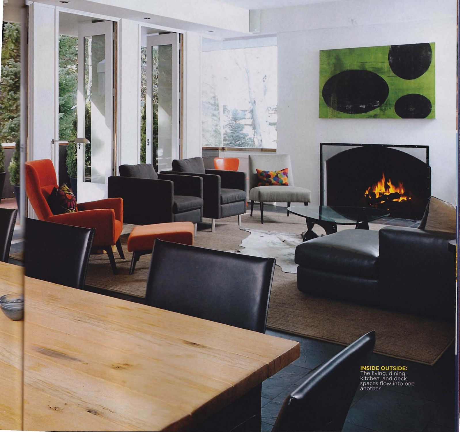
INSIDE OUTSIDE: The living, dining, kitchen, and deck spaces flow into one another