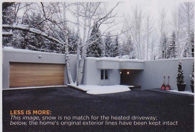
LESS IS MORE: This image, snow is no match for the heated driveway; below, the home's original exterior lines have been kept intact