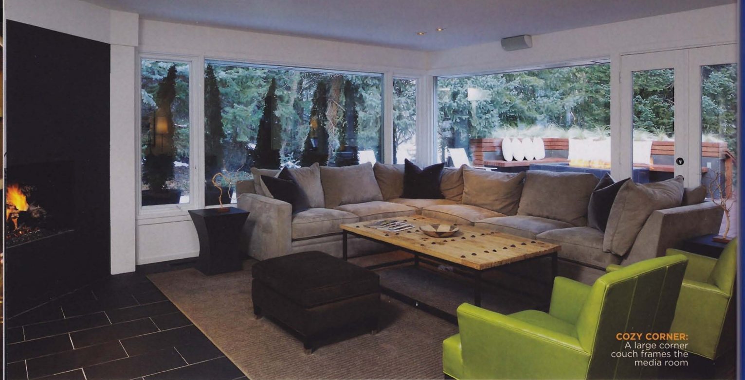
COZY CORNER: A large corner couch frames the media room

“The way the house flows, and the light that surrounds it from all angles, makes it a very peaceful place.”